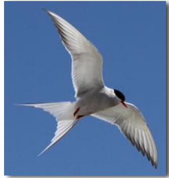
The Arctic tern molts during the winter and rarely flies, instead choosing to rest on ice by the seashore.

International Migratory Bird Day, celebrated on the second Saturday in May, is a day to celebrate the 4,000 different species of birds that migrate around the globe. That's over 40% of all bird species. For these birds, migration means survival. As the seasons change, birds leave areas where resources are scarce and embark on journeys to areas with more resources where they can hatch and raise their young. For many birds, the scale of their migratory journeys is mind-boggling.