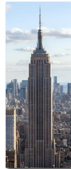
The Empire State Building's uppermost tower was originally designed as a mooring mast for blimps.

On May 1, 1931, American President Herbert Hoover officially opened New York's Empire State Building, then the tallest building ever constructed in the world, by pressing a button in the White House that turned on the lights of the New York skyscraper.